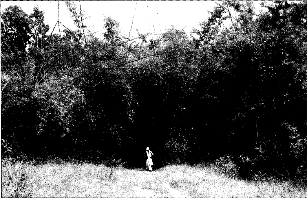
Figure 3. Kalbhiraobache ban with natural bamboo in Kolawade sacred grove in Maharashtra.

In other words, the deep foliage of the groves creates microclimate which permits regeneration and sustenance of biotic species that are not usually found in the surroundings. Religious forest patches can provide ample leaf litter and manure to the surrounding vegetation. Local and tribal people collect leaf litter to enrich their fields with organic manure (Kumbhojkar and Kulkarni, 1998).