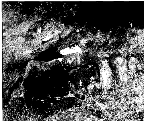
Figure 2. Stone idols of the ferocious deity Kalubai outside Lawarde sacred grove in Maharashtra.

In Maharashtra, several groves are dedicated to ferocious deities such as Bapujiboova , Kalubai (Fig. 2), Navlaidevi , Mariai , Andharidevi , Kadjai , Dongraidevi , Jakuradevi , Kalkai , Kalbhairi , Vanghrunjai , Gulumbai , and Chiraidevi . However, there are sacred groves, which are dedicated to deities that are not thought to be of ferocious nature such as Maruti , Ganpati , and Khandoba .